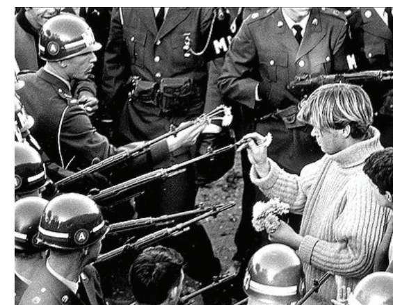
Ice Cream Social Security